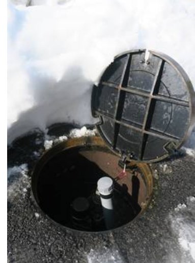
Installing a transmitter in a manhole

This initiative was part of a wider set of demonstrative field tests that began in May 2016 by Hitachi Systems, TOMISU and eTRUST. This solution is intended to provide comprehensive support for manhole crime prevention and safety measures using sensors and IoT technology to monitor manholes for the presence of dangerous substances, and to detect whether the manhole cover is open or shut, the emission of noxious fumes, and water quality and levels, in addition to providing other information intended to prevent worker accidents during equipment inspections. While initial field